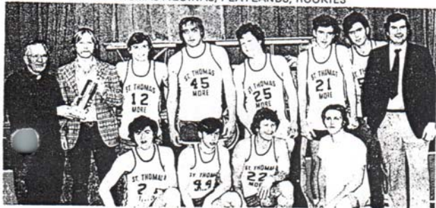
ST. THOMAS MORE SENIORS

CYO HELD ITS '77 version of the diocesan boys basketball playoffs at two different Queens sites. Over 200 trophies were presented to the eight champions and eight runners-up.