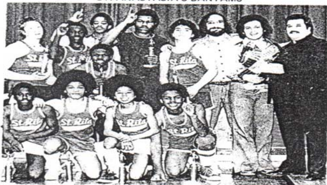
ST. RITA'S, EAST NEW YORK, CADETS