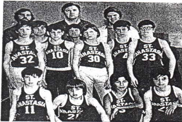
ST. ANASTASIA'S BANTAMS