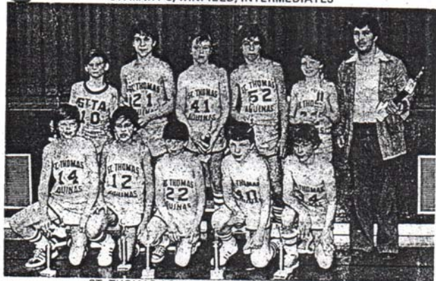
ST. THOMAS AQUINAS, FLATLANDS, ROOKIES