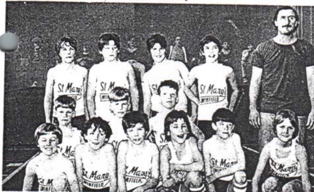
ST. MARY'S, WINFIELD, NOVICES